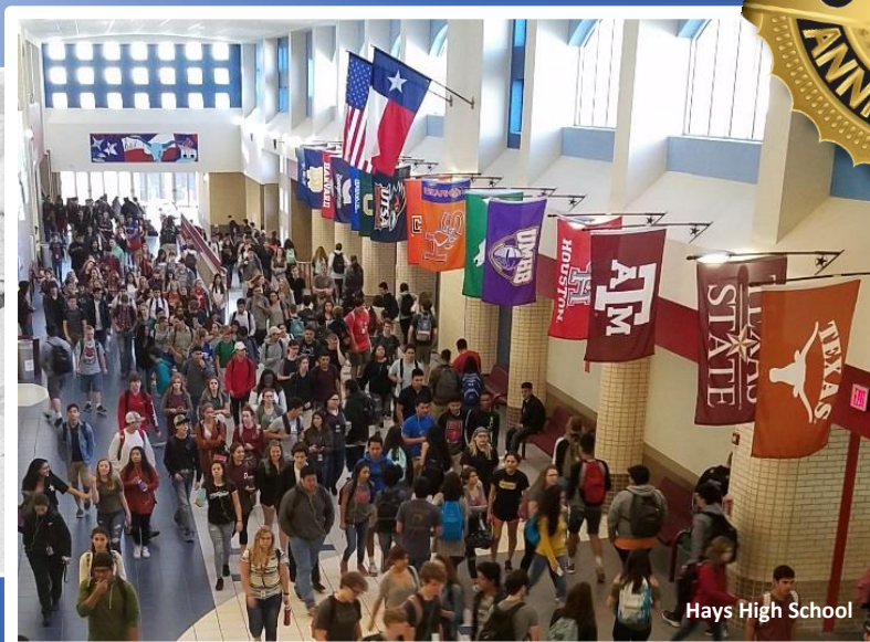
Hays High School