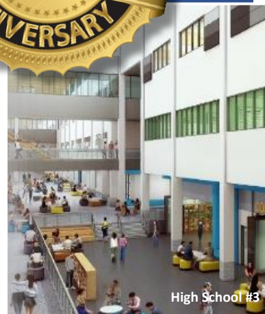
High School #3